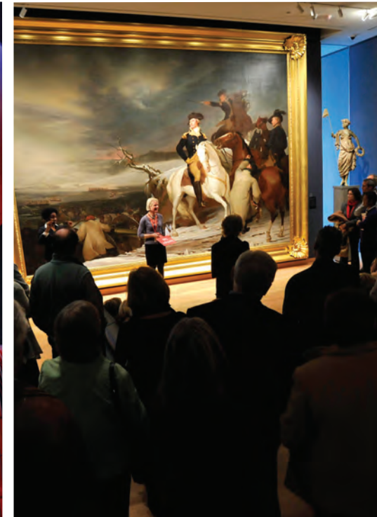
MUSEUM OF FINE ARTS, BOSTON