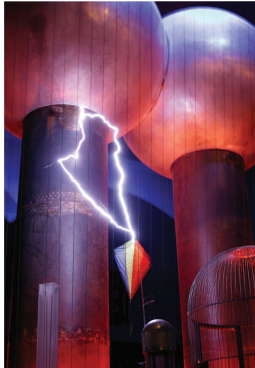
MUSEUM OF SCIENCE