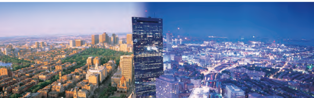
SKYWALK OBSERVATORY AT THE PRUDENTIAL CENTER