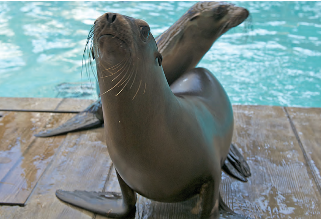
NEW ENGLAND AQUARIUM