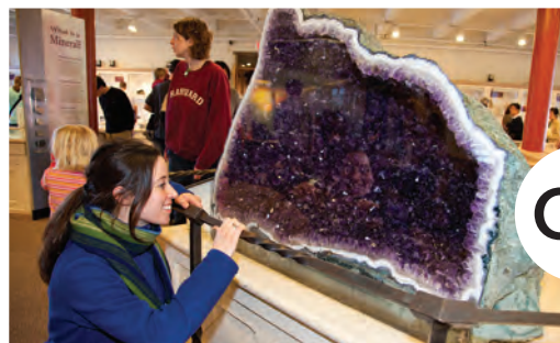
HARVARD MUSEUM OF NATURAL HISTORY