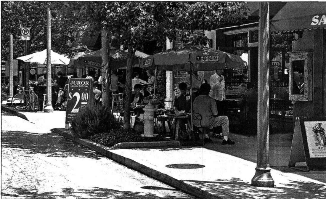
DEKALB CONVENTION AND VISITORS BUREAU