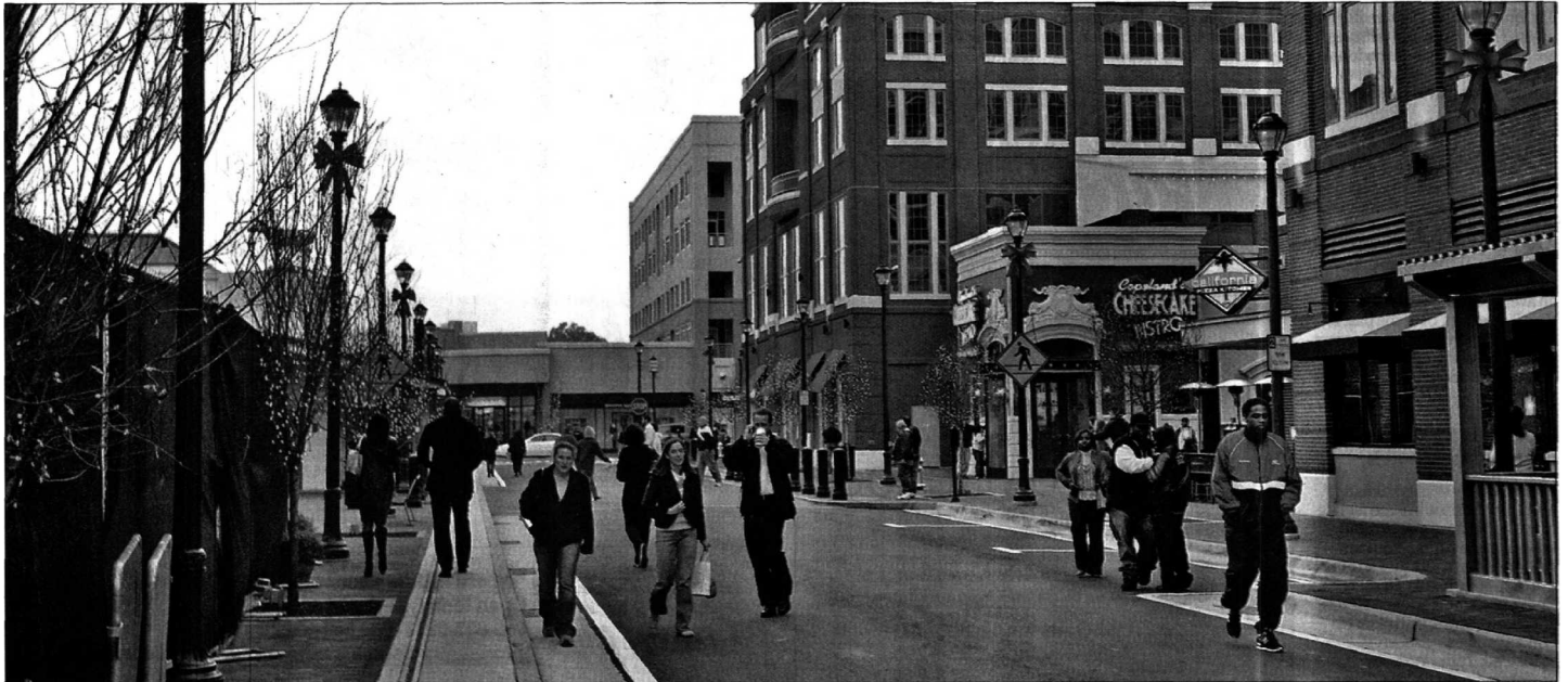
Narrow streets and broad sidewalks make Atlantic Station a pedestrian-friendly destination.