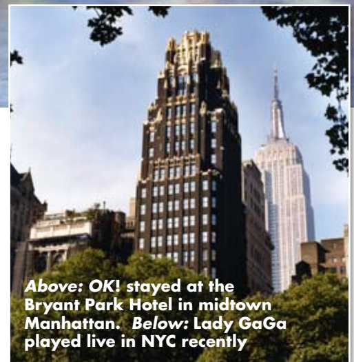
Above: OK! stayed at the Bryant Park Hotel in midtown Manhattan. Below: Lady GaGa played live in NYC recently

The hotel's vaulted Cellar Bar is a popular haunt with the fashion pack, while the Japanese fusion restaurant Koi, all dark woods and orchids, is also the place to be seen. Kelly Osborne and Nicole Ritchie have both been spotted here.