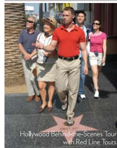
Hollywood Behind-the-Scenes Tour with Red Line Tours