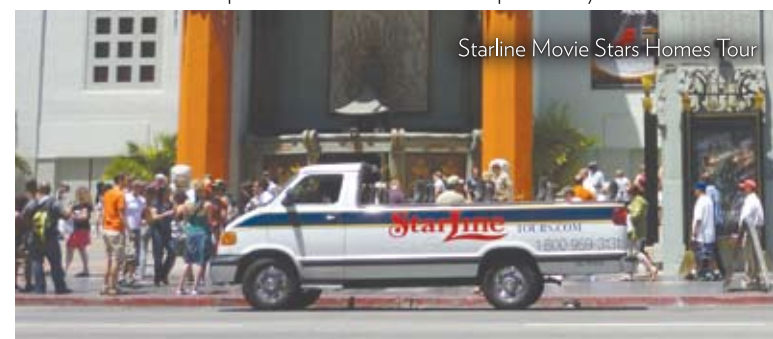
Starline Movie Stars Homes Tour

Skip most ticket lines • Valid up to 9 days