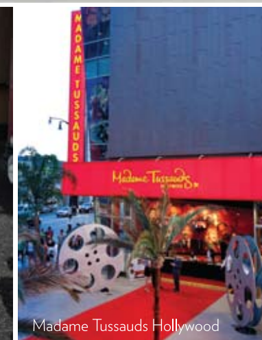
Madame Tussauds Hollywood