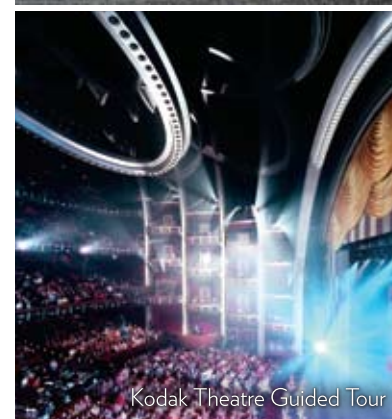
Kodak Theatre Guided Tour